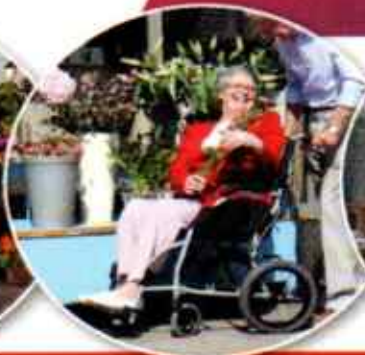
WHEELCHAIRS MANUAL & POWERED