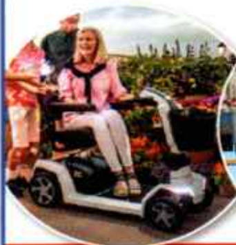
SCOOTERS NEW & USED