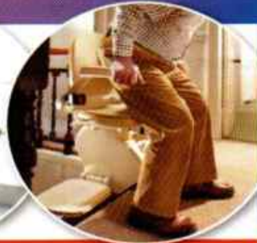
STAIR LIFTS STRAIGHT & CURVED