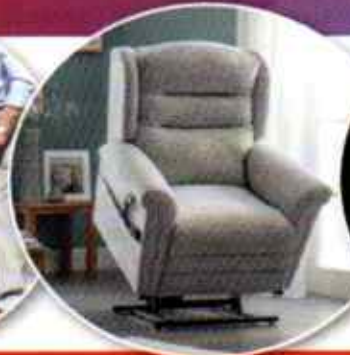
LIFT CHAIRS DOMESTIC / BARIATRIC